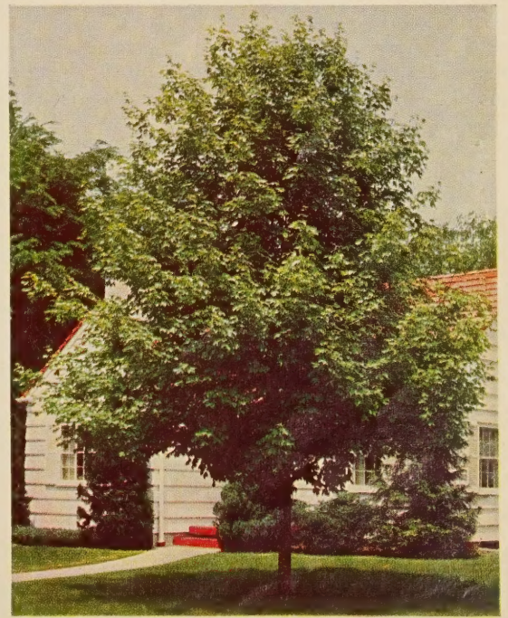
Fast Growing Silver Maple.

BROAD-LEAVED EVERGREENS. Including Azaleas, Hollies, Boxwood, Hybrid Rhododendrons. Write for 56-page Planting Guide Catalog illustrating many in color.